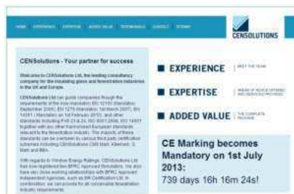
CENSOLUTIONS COUNTS DOWN TO CE MARK