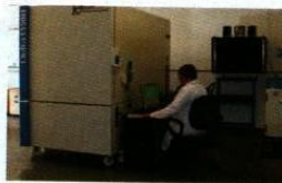
CENSolutions has been advising its customers to follow the CE Marking route for some time.

For more information visit www.censolutions.com or call 01785 716625