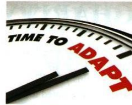
CE Marking is due to become mandatory in 2013.

We were given a reprieve with the Building Regulations as industry bodies decided to offer an 'easy' way to comply and in the wider economy things are just starting to show a tentative sign of recovery, but as things start to settle down we hear news of more new legislation on the way. This development has been in the pipeline for some time and shouldn't be a reason for concern. Yes, it means sealed unit manufacturers, toughened glass processors and window and door fabricators have to adhere to another piece of legislation, but it also provides us with an opportunity to up the ante and streamline a lot of the ways we demonstrate compliance.